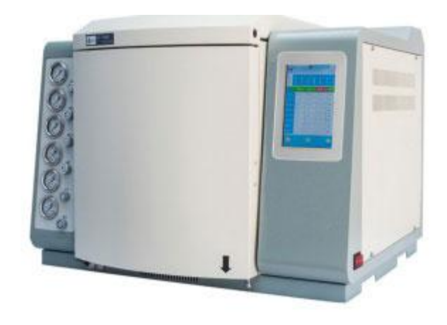
Weshine® GC Gas Chromatography

after-sales service is Excellent.Looking forward to have a good and long partnership with you.